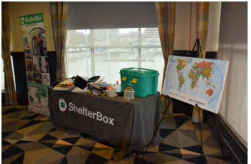
Shelter Box supplies