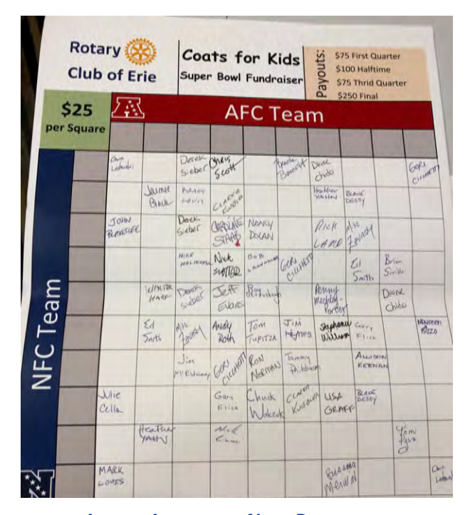
Larger Image on Next Page >>>