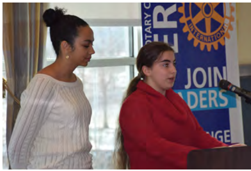
World Affairs update by Collegiate students