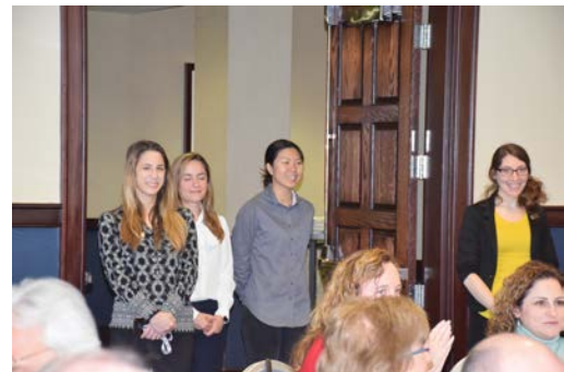
Thanks to our catering staff