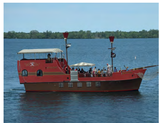
the Scallywag Pirate Ship made an appearance outside our meeting window. Ahoy!