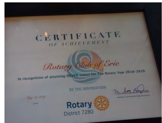
Club award received at last month's District Conference