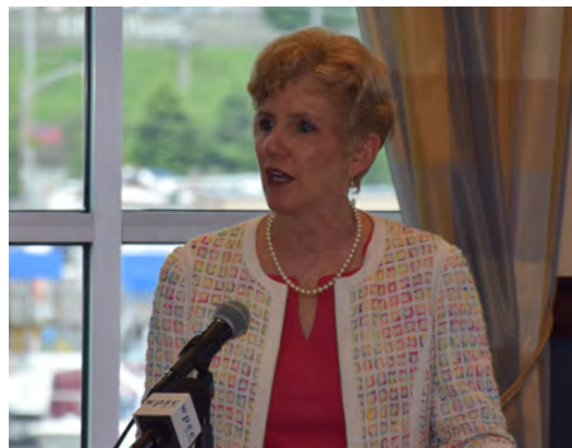
Speaker, Kathy Dahlkemper