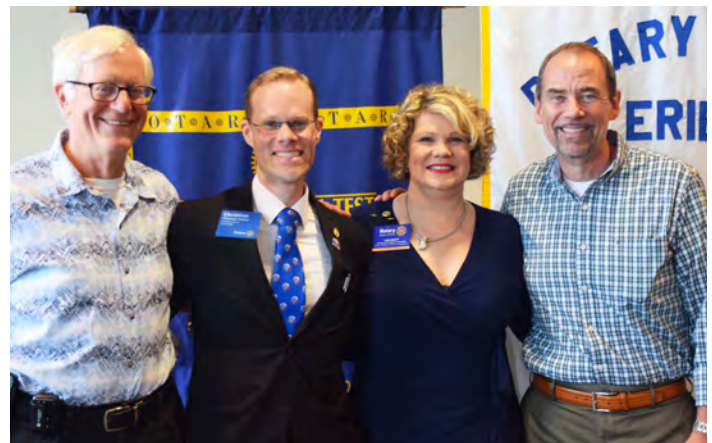
Meadville Rotarian Friends!