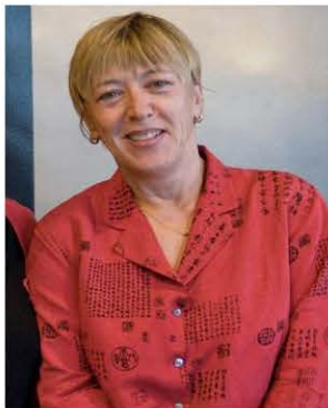
1997 Noble Peace Laureate

Finding the Balance: Security and Human Rights in the Contemporary World