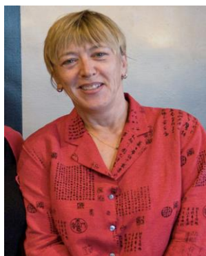
1997 Noble Peace Laureate

Finding the Balance: Security and Human Rights in the Contemporary World