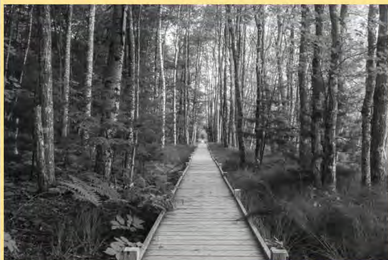
"Boardwalk and Birch Trees"