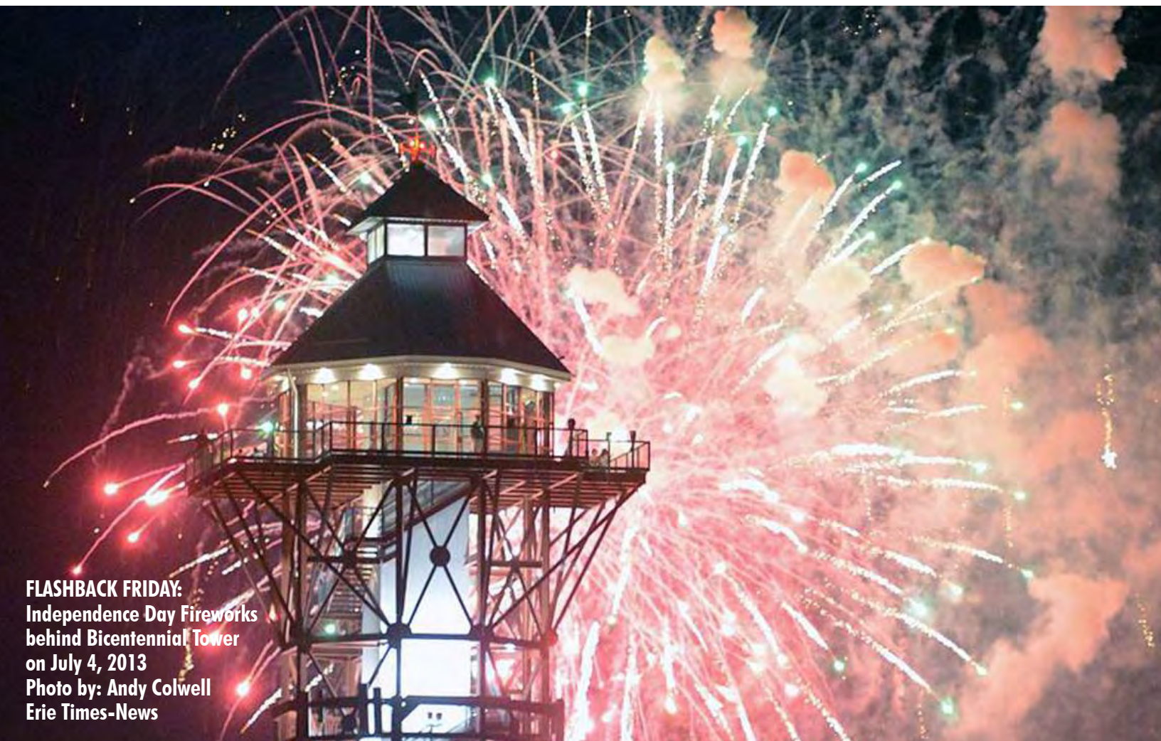
FLASHBACK FRIDAY: Independence Day Fireworks behind Bicentennial Tower on July 4, 2013