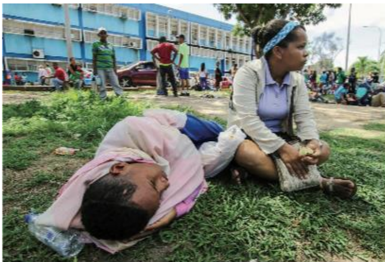
Venezuelans wait outside a health center for malaria treatment in November, 2017.

518,000 cases of malaria with over 300 deaths in the last 12 months - a malaria EPIDEMIC in Venezuela