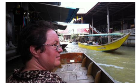
International Conventions, Bangkok Thailand