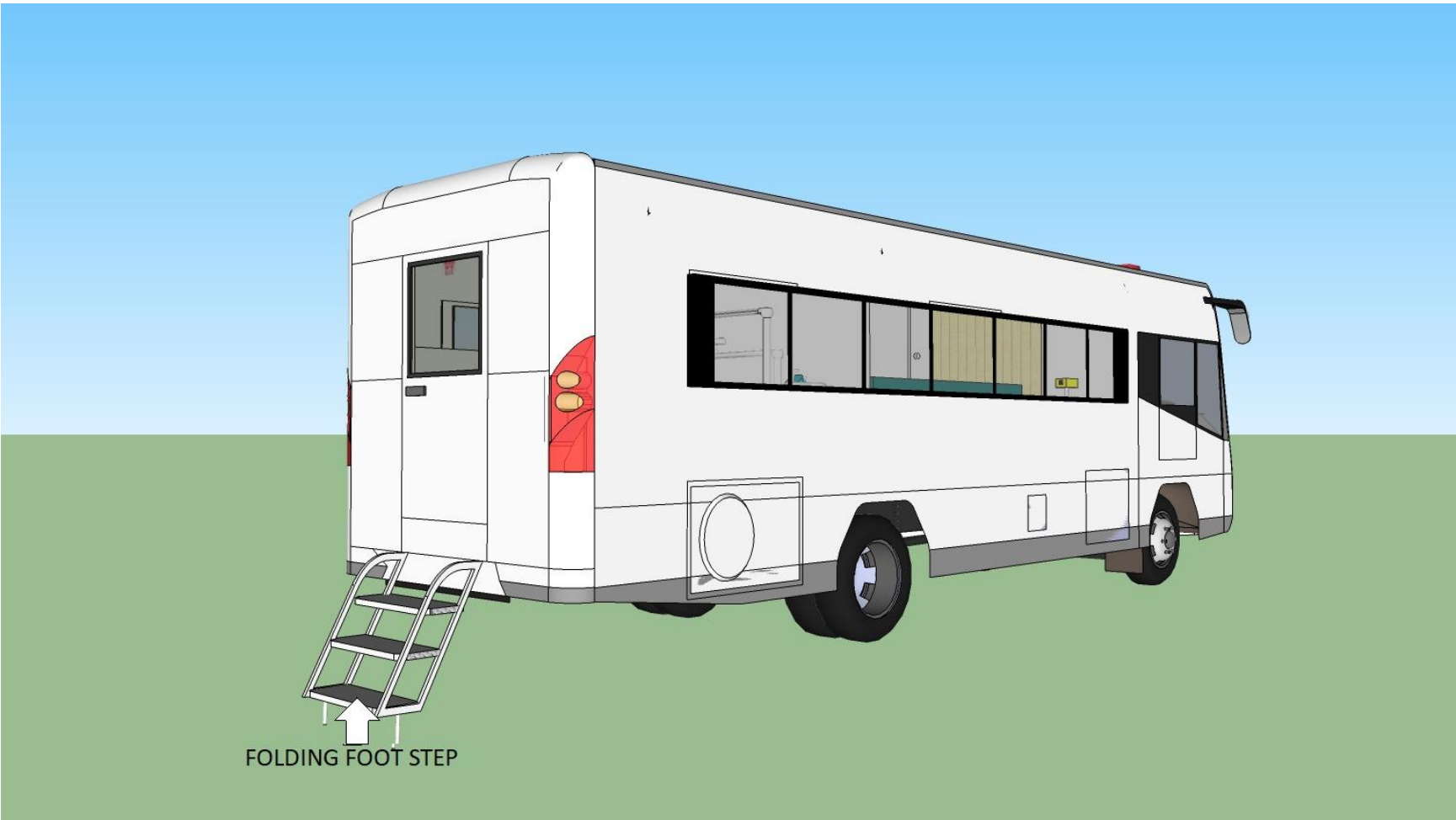
MOBILE CANCER DETECTION VEHICLE - Global Grant LEAD BY RC of LBV