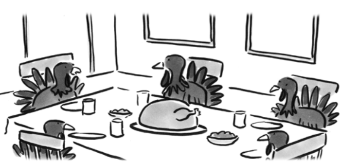
"I know it's just tofu, but it still creeps me out."