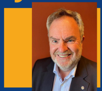
Rotary Club of South Queensferry Lothian, Scotland

For being nominated for President of Rotary International for 2023-24!