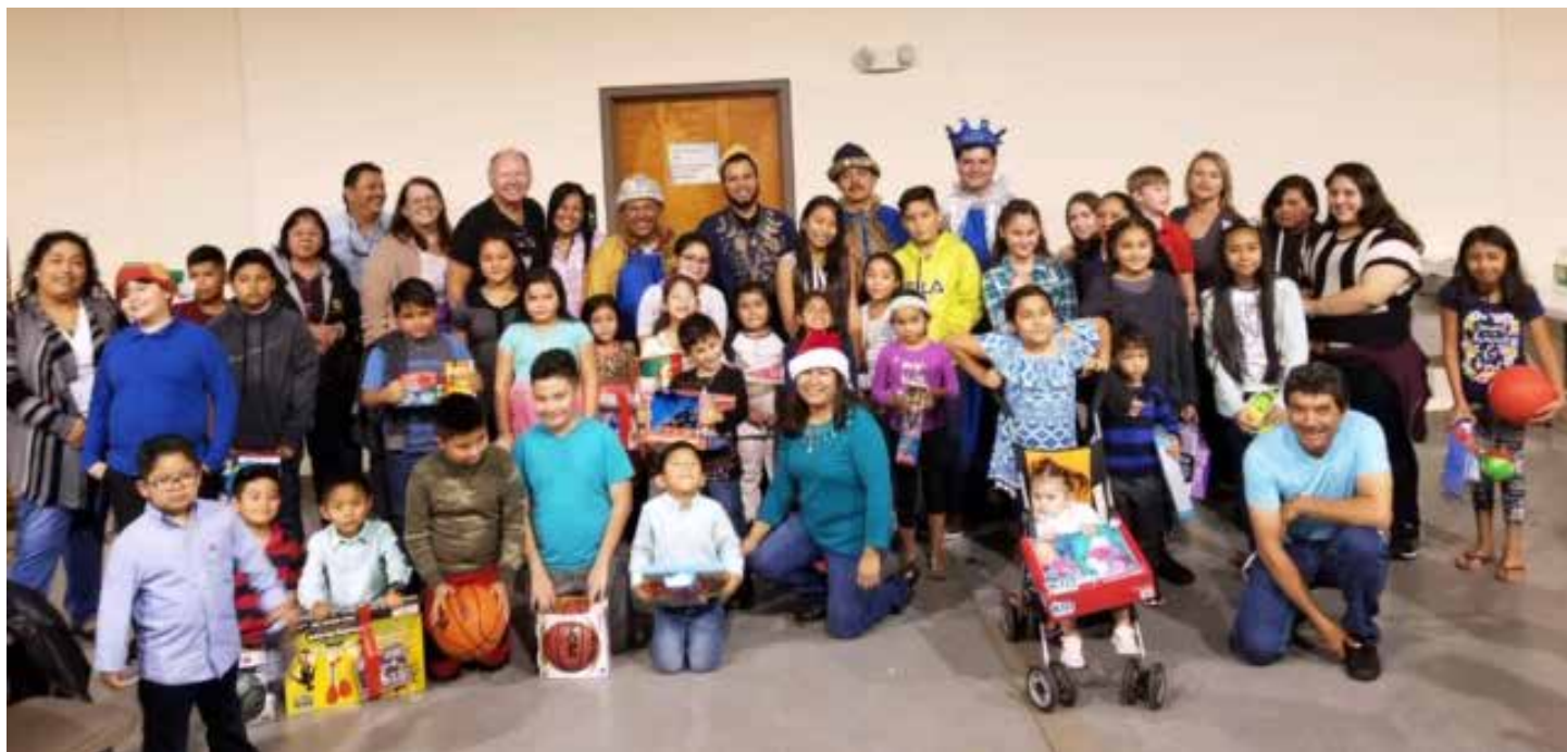
Many of the families that gathered at the Mission for the Three Kings Celebration