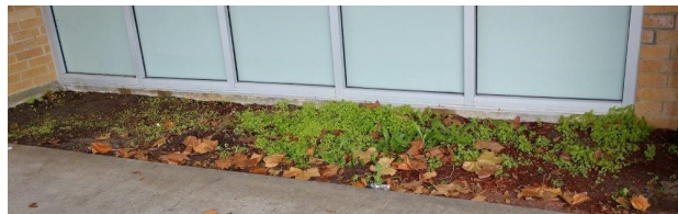
All in Weeds before we started!