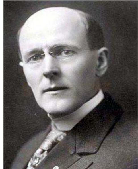
Rotary Founder Paul Harris