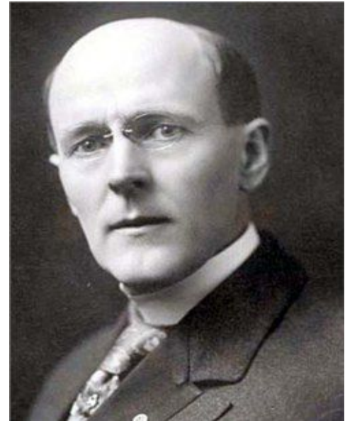
Rotary Founder Paul Harris