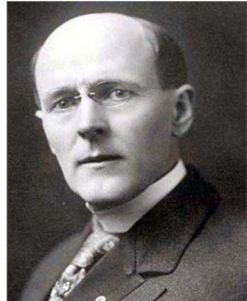
Rotary Founder Paul Harris