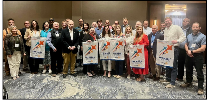
District 6880 President Elect Class of 2024-2025