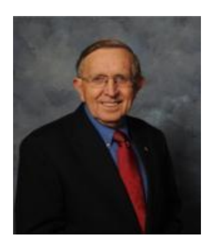
A CONSUMATE PROFESSIONAL We are building on his contributions to the DLP.