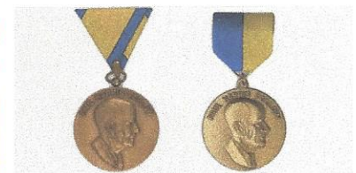
The first Paul Harris Fellow Medallion, on the left, and a later version.

Have you heard (I don't remember if it's true) someone say "as we get older we become forgetful"?