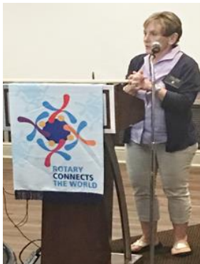
Colleen reports on The Rotaract Club meeting at SMHS. Fourteen students are involved.