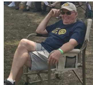
From the Music Festival. When it's time to listen to the music.

Make ups: On the web: www.rotaryclubone.org Crossville: Wed. 6:30 AM, Crossville Breakfast Club, Cumberland Medical Center or Thursday Noon, Crossville Noon Club, Cumberland Mountain State Park.