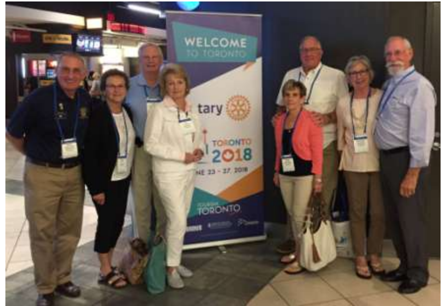
Fellowship and Speakers