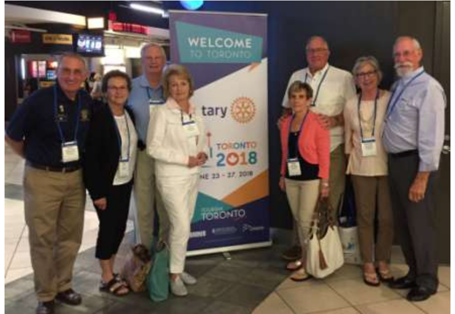
Fellowship and Speakers