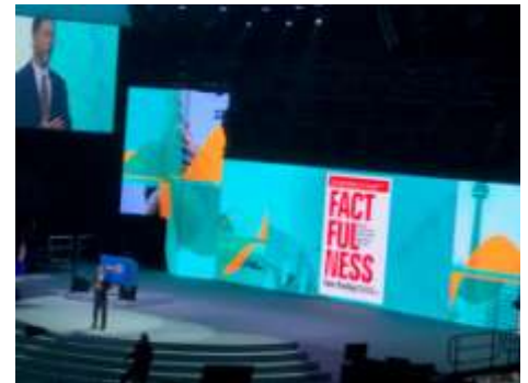
With 25,000 plus Rotarians attending –crowds and lines