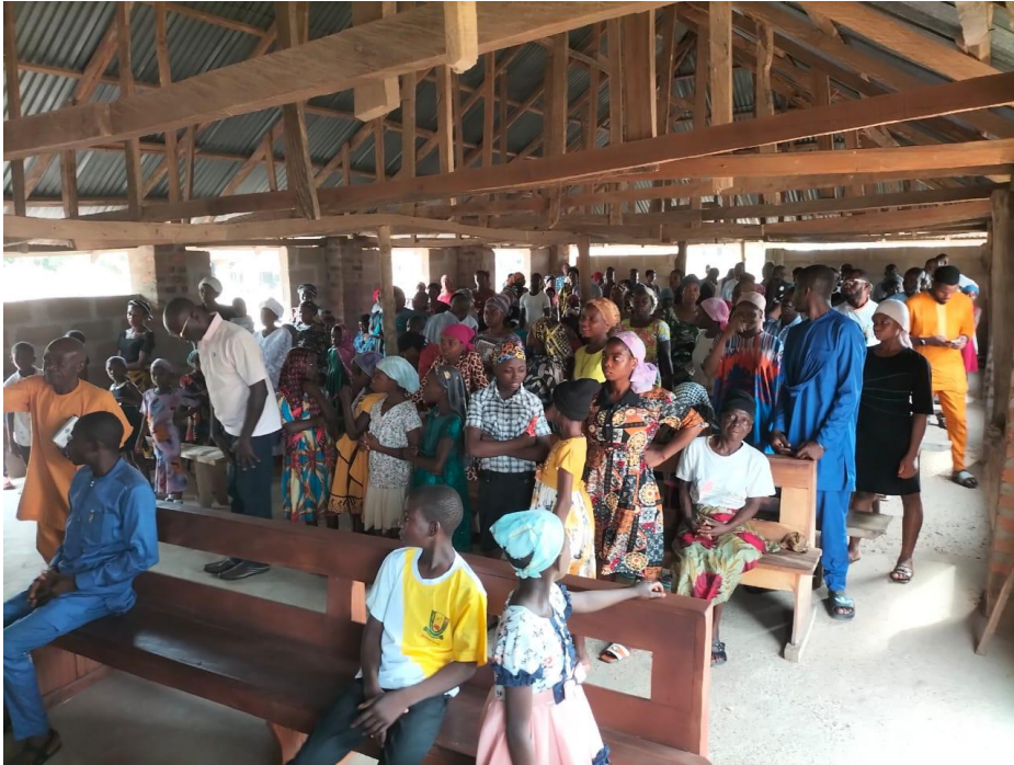
Community Assessment Meeting