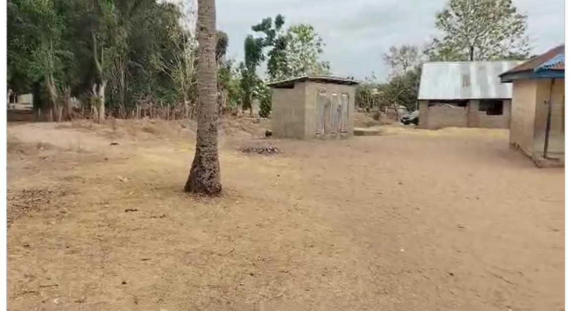
Estimated Borehole Well location behind church