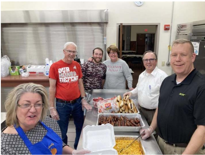
Circleville Rotary day at Monday's food kitchen.