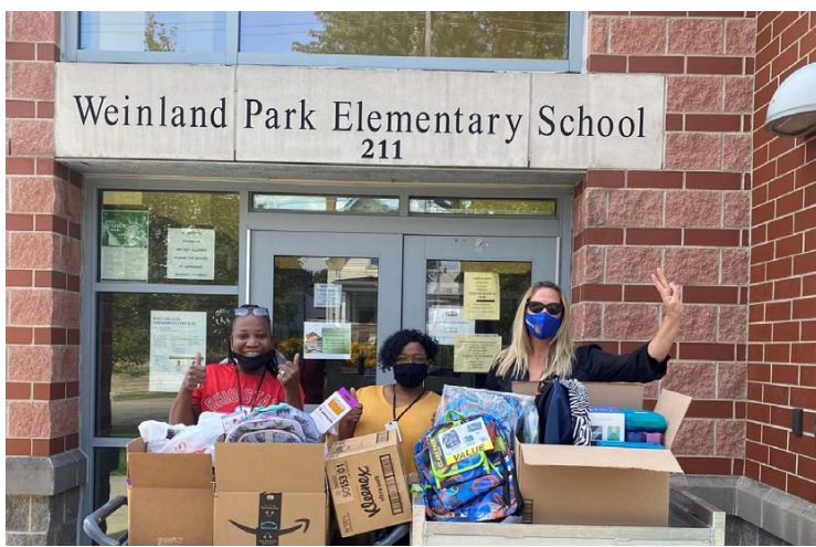
Park Elementary School for the start of the school year next week.