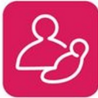
Maternal and Child Health