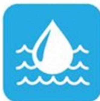
Water and Sanitation