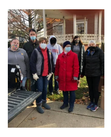
Lancaster Rotary and Rotary Club of