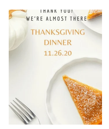
Newark Rotary Club