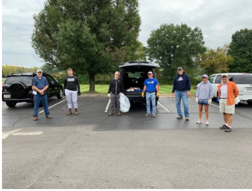
Annual roadside cleanup on Hopewell Drive in Heath