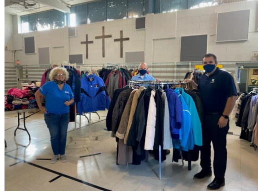
Club members volunteered hanging and sorting coats for Look Up Ministries' annual coat give-away.

Tell us about YOUR club's service projects!