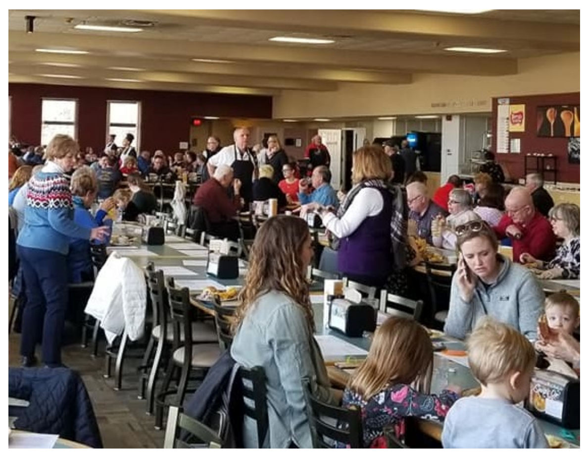
Rotary Club of Westerville

What a great turnout for their Rotary Valentine dinner and dance. The proceeds will go to scholarships for our Wellston High School Seniors!!