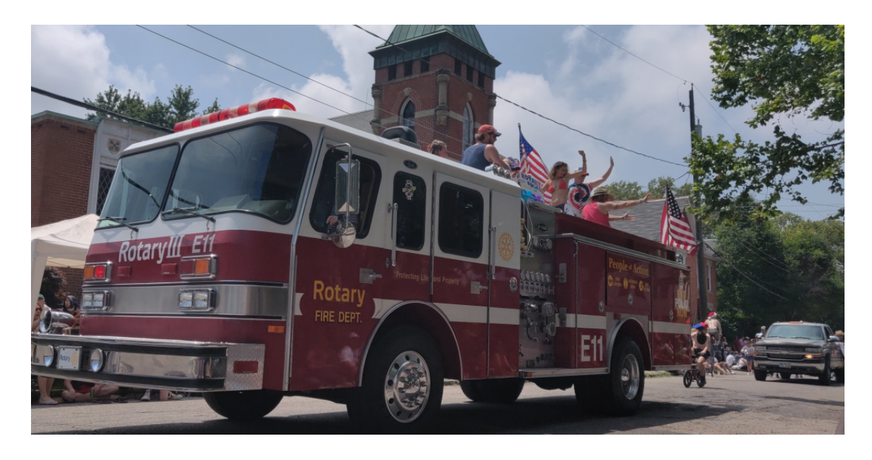
The Short North Rotary Doo-ing what Rotarians Do in the 2019 Doo-Dah Parade.