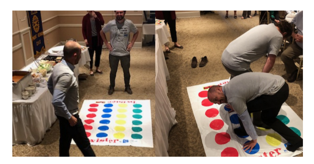
Mount Vernon Rotary remembers to have FUN at their meetings!