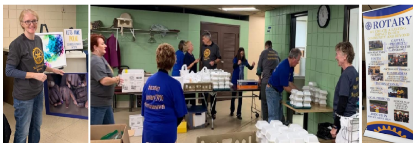
Well done, St. Clairsville!