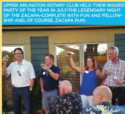
UPPER ARLINGTON ROTARY CLUB HELD THEIR BIGGEST PARTY OF THE YEAR IN JULY-THE LEGENDARY NIGHT OF THE ZACAPA-COMplete WITH FUN AND FELLOWSHIP AND, OF COURSE, ZACAPA RUM.