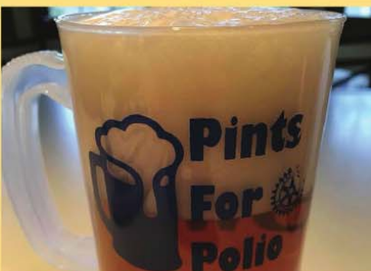
THE ROTARY CLUBS OF CAMBRIDGE AND BYESVILLE HOSTED PINTS FOR POLIO, RAISING OVER $740 TO HELP ERADICATE POLIO. WITH THE 2-1 MATCH FROM THE BILL AND MELINDA GATES FOUNDATION, GUERNSEY COUNTY ROTARIANS RAISED OVER $2,220!