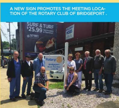
A NEW SIGN PROMOTES THE MEETING LOCATION OF THE ROTARY CLUB OF BRIDGEPORT.