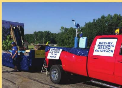
THE ROTARY CLUB OF SUNBURY-GALENA WINS THE FLOAT AWARD IN THE SUNBURY 4TH OF JULY PARADE.