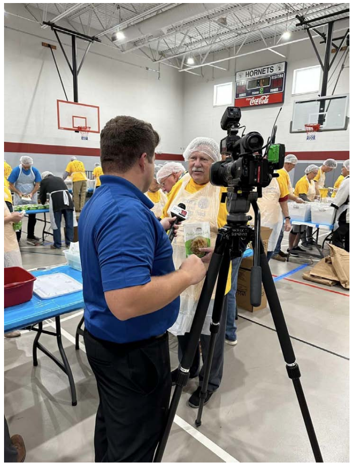
Miamisburg's 63rd Annual Pancake Breakfast