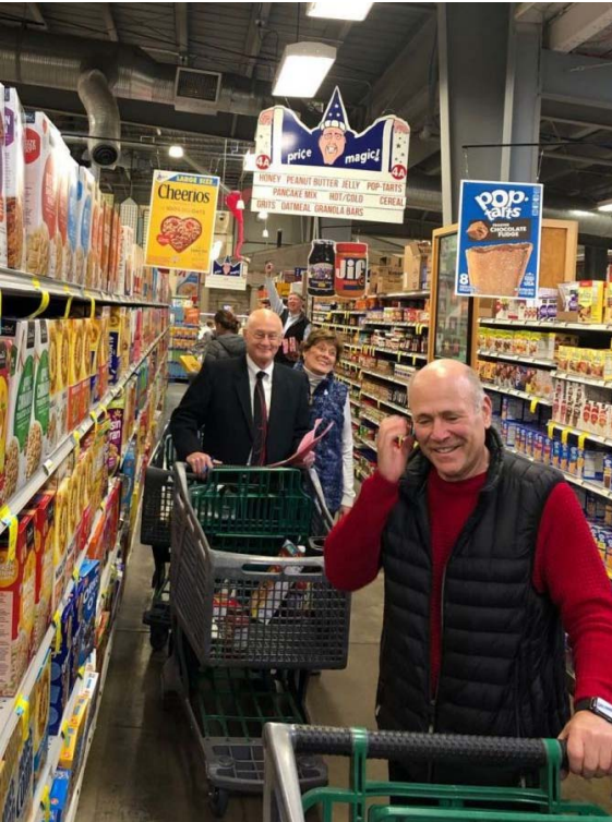
Cincinnati Rotary Blood Drive