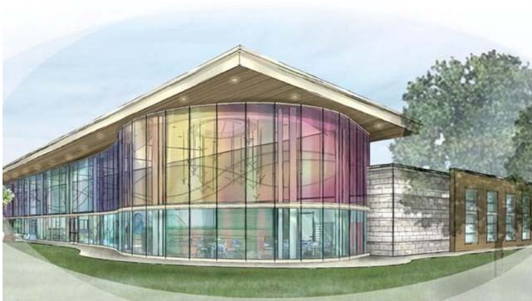
Rendering of the Little Fork Advocacy Center

Funds raised at the event will support the Little Fork Advocacy Center, a comprehensive campus where specialists can address problems such as domestic violence, physical and sexual abuse, suicide and drug addiction all under one roof. All of these issues can be interconnected, but there's currently no comprehensive approach in Clermont County -- or even Ohio -- to tackle them in one place. Little Fork Family Advocacy Center will provide a complete network of survival and coping needs to those who have gone through traumatic experiences. The Center is unprecedented in its collaborative approach and its focus on the care of an entire family. Government, medical and aftercare services will share the space, making the recovery process more accessible to more people. This puts the focus on healing for victims and their families ♦ affecting generations to come. The mission of Little Fork connects closely to the Cincinnati Eastside Rotary's commitment to supporting children's causes in the community.