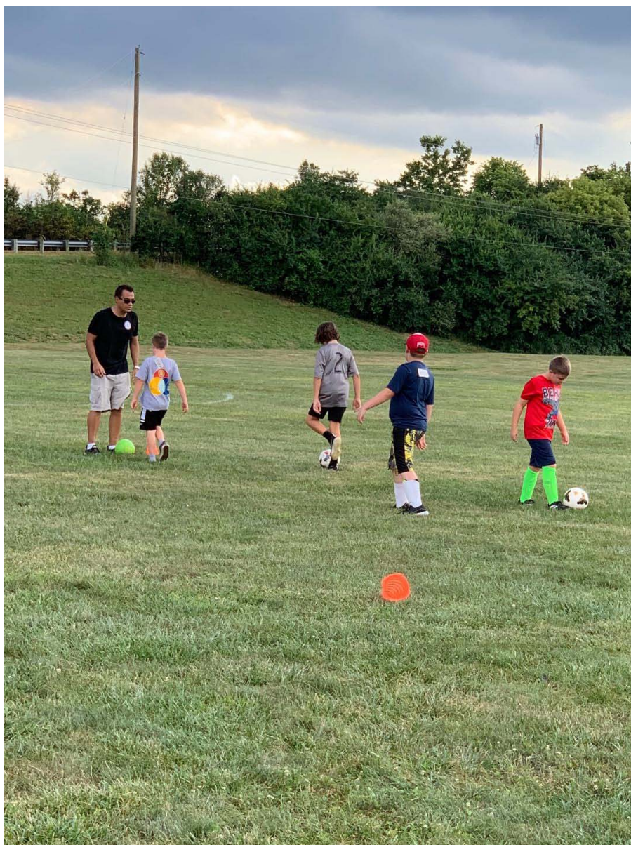
Soccer. Over 50 children participated this year, and a great time was had by everyone.