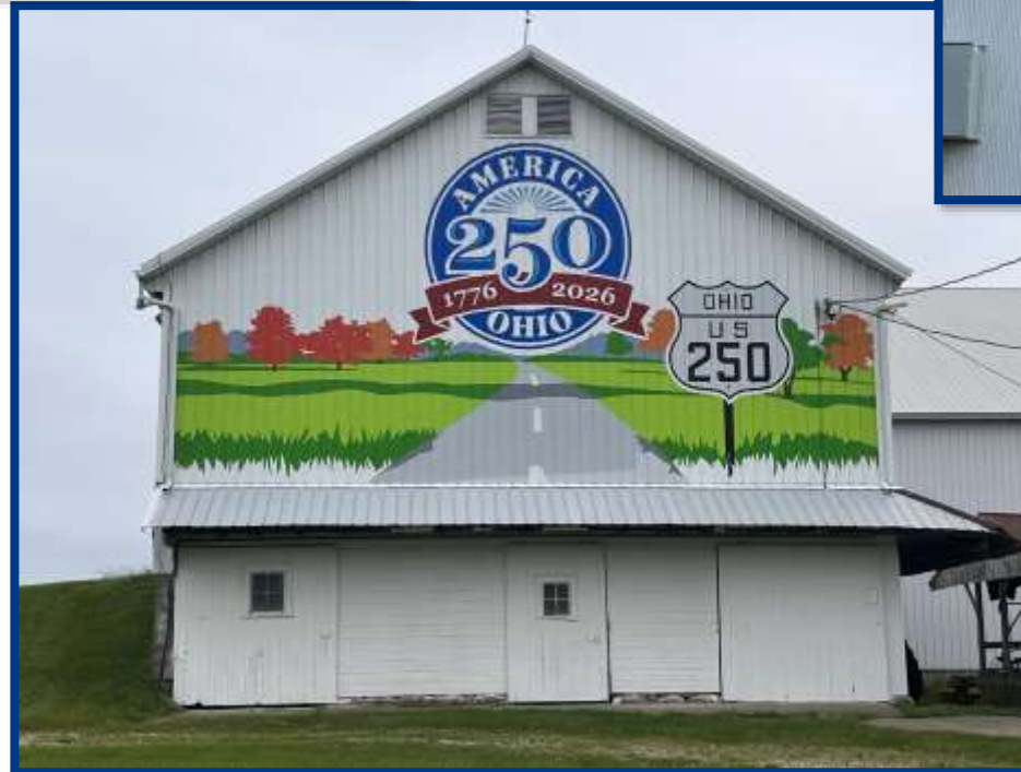
U.S. Route 250