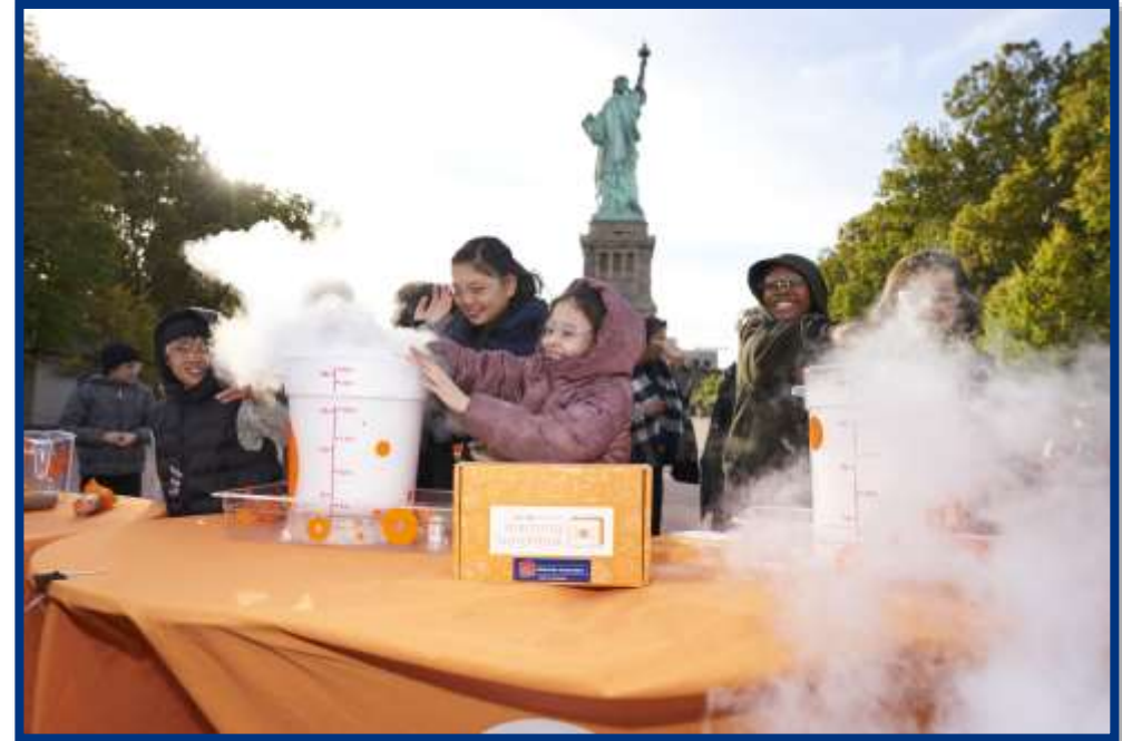
COSI – America 250 American Innovation Hands-On Kits