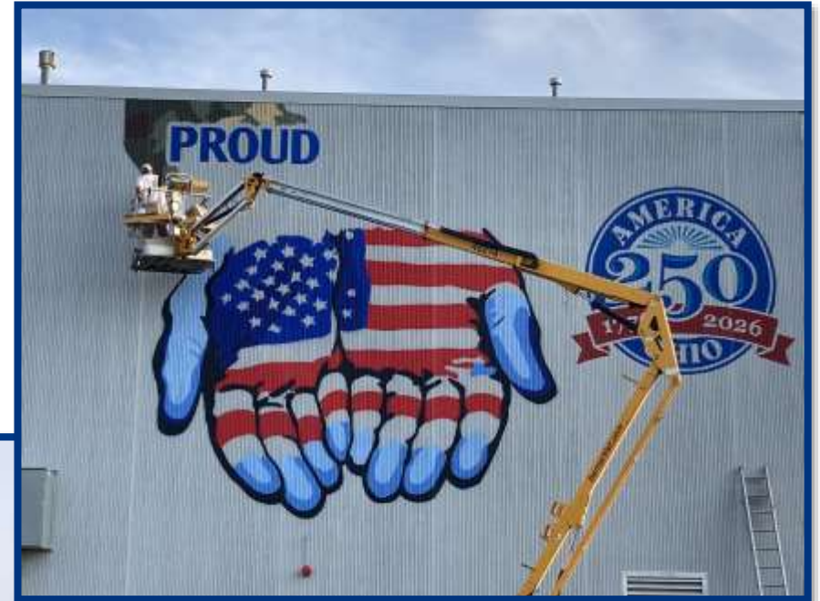
American Nitrile Building, Grove City, Ohio