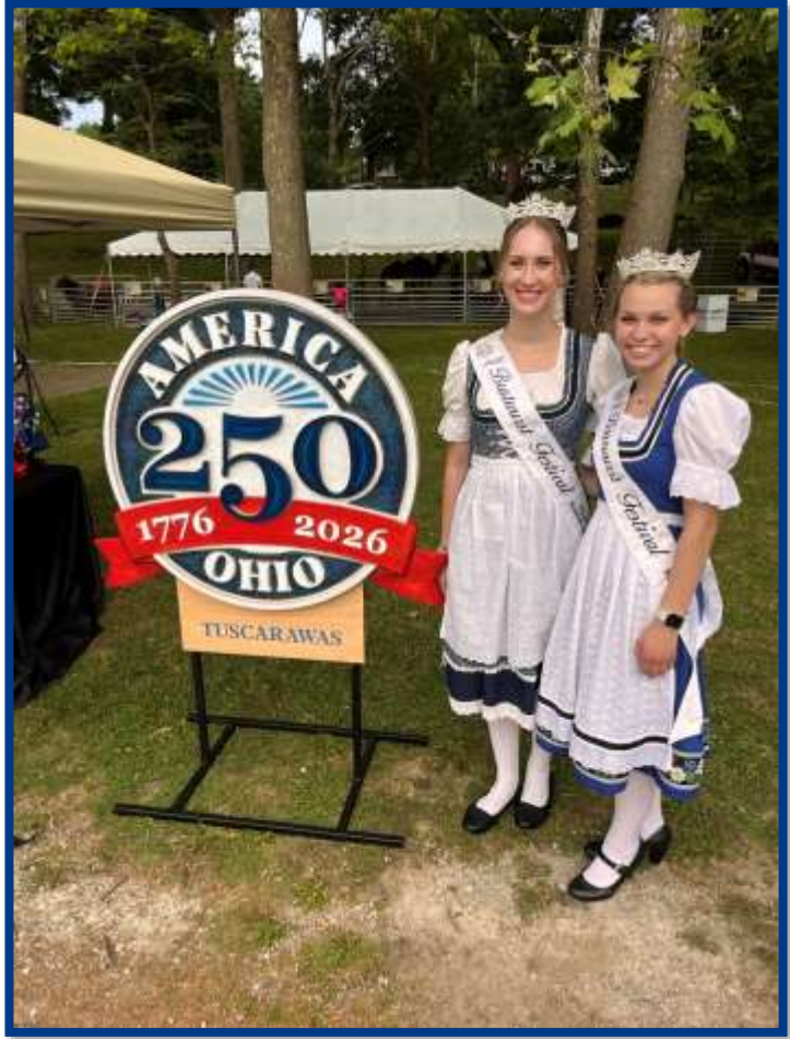
Bucyrus Bratwurst Festival Queens – New Philadelphia First Town Days-2023