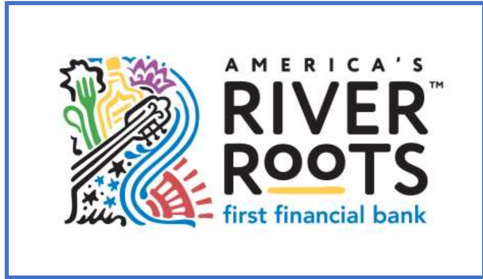
America's River Roots Cincinnati Ohio October 9-12, 2025