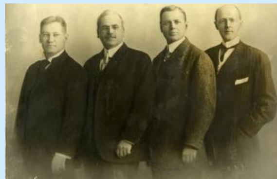
The first four Rotarians.

We're not afraid to dream big and set bold goals. We began our fight against polio in 1979 with a project to immunize 6 million children in the Philippines. Today, polio remains endemic in only two countries — down from 125 in 1988.