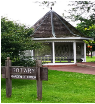
The Gazebo in the Rotary Garden of Honor at Soldiers Memorial Park was built by La Porte Rotarians