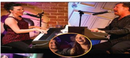
HOWL AT THE MOON