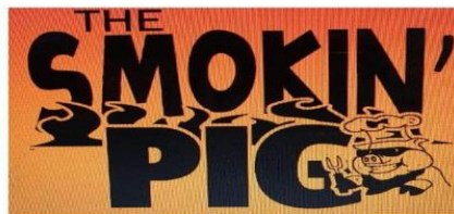
THE SMOKIN' PIG FOOD TRUCK