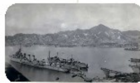
Japanese Destroyers after Hiroshima