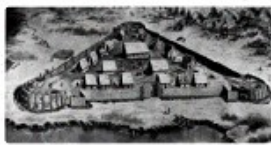
Greene's Manor, Maryland