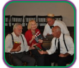
Inherit the Wind Stars!!

TICKETS ARE ON SALE NOW. Tickets are $50 and can be purchased online at info@PeoriaRiverfrontMuseum.org or by calling the Museum at 309-686-7000.