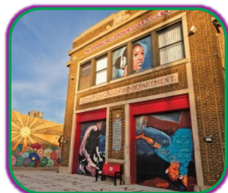
Emcee Skool Firehouse