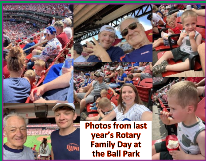
Photos from last year's Rotary Family Day at the Ball Park

Buying Tickets Helps with The Literacy Projects