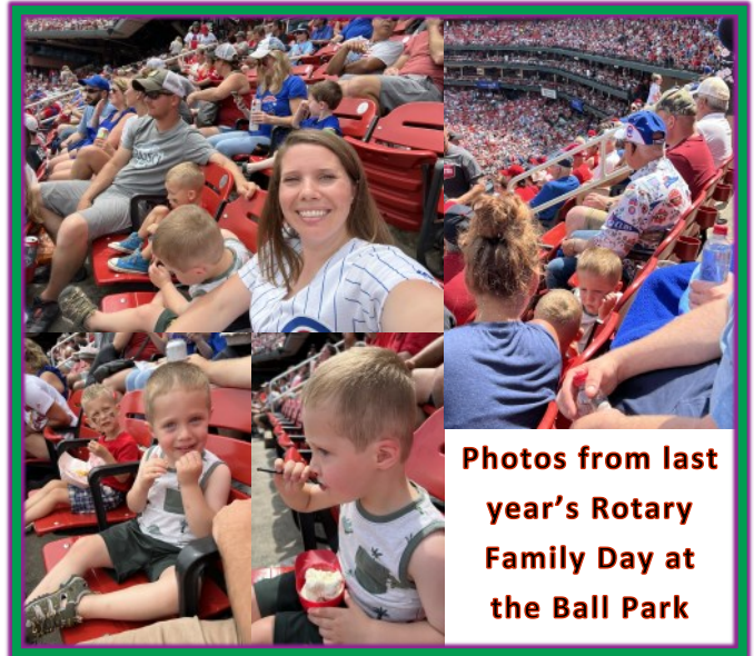
Photos from last year's Rotary Family Day at the Ball Park