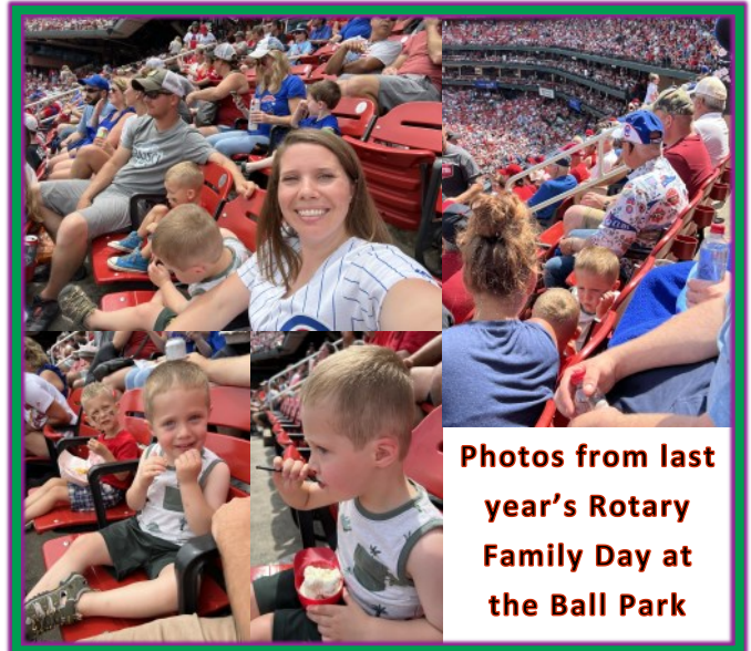
Photos from last year's Rotary Family Day at the Ball Park

Buying Tickets Helps with The Literacy Projects